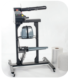
System Stand and Roll Winder

The NewAir I.B.® Flex™ is supported by a large array of system accessories, making it flexible enough to be used in all packaging operations. NewAir I.B.® Flex™ is fast enough to keep up with the most demanding packaging operations.