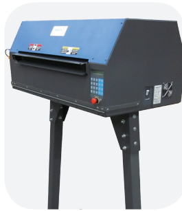
Instasheeter™ Converting System

With the optional Roll Winder accessory, the NewAir I.B.® Flex™ system can create a 36" diameter roll of material in under two minutes, for decentralized packaging environments.