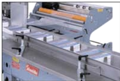
Adjustable Flight Lug Infeed