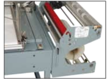
EZ Load Film Unwind