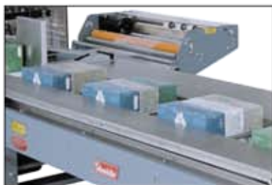
Adjustable Flight Bar Infeed

By selecting just the right combination of options, you can customize your Shanklin A-Series Automatic L-Sealer for the ultimate performance, efficiency and value!