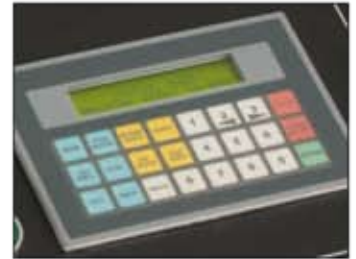
Color Coded Touch Screen