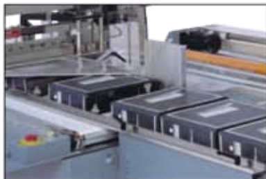
Product Spacing Infeed Conveyor