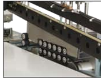
Automatic Film Puller